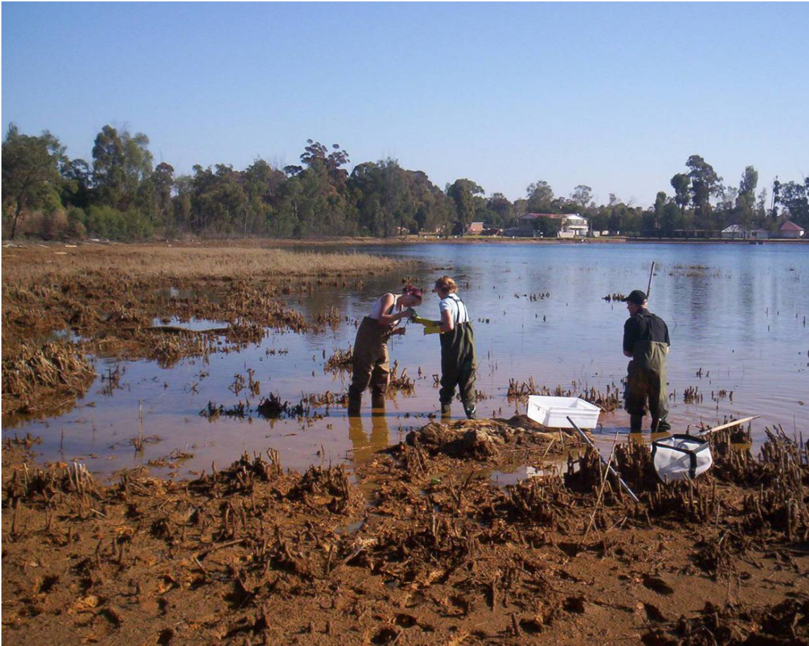
Figure 2: AMD containing water from Harmony Gold Mine in Robinson Lake in Randfontein

The sulphuric acid content in stagnant water in deep mines become concentrated enough to dissolve rock and set the metals it contains free. The most common metals released by sulphuric acid in gold mines on the Witwatersrand include manganese, aluminium, iron, nickel, zinc, cobalt, copper, lead, radium, thorium and uranium (Kleywegt, 1977; Venter, 1995; Coetzee et al. , 2006). The high iron content of AMD turns the water orange (See Fig. 1).